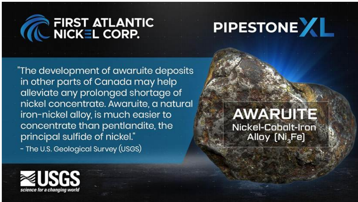
Figure 2: Quote from USGS on Awaruite Deposits [1]

Awaruite ( \text{Ni}_3\text{Fe} ) is a naturally occurring nickel-iron-cobalt alloy containing approximately 77% nickel [2] , or 2 to 3 times the nickel content of typical sulfide minerals such as pentlandite (~25% Ni) [3] . The nickel identified to date at the RPM Zone is hosted in awaruite, making it magnetically recoverable through magnetic separator drums used safely for over a century in North American iron ore operations.