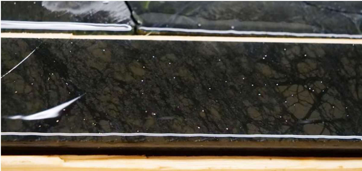
Figure 1: Example of large-grained awaruite (Ni 3 Fe Nickel-Iron-Cobalt Alloy) visible in drill core from the RPM Zone at the Pipestone XL Nickel Alloy Project, illustrating the mineral's distinctive metallic texture and exceptional grain size.