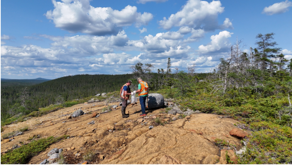
Figure 2: Geologists investigating an outcrop on the Pipestone XL Nickel Alloy Project.