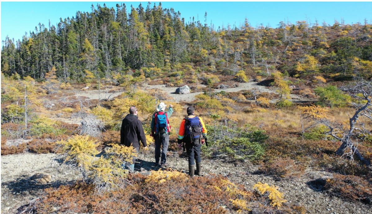
Figure 3: View across a portion of the RPM Zone, showing typical dry, mound-type topography with limited vegetation due to the high magnesium content of the underlying ultramafic rocks.