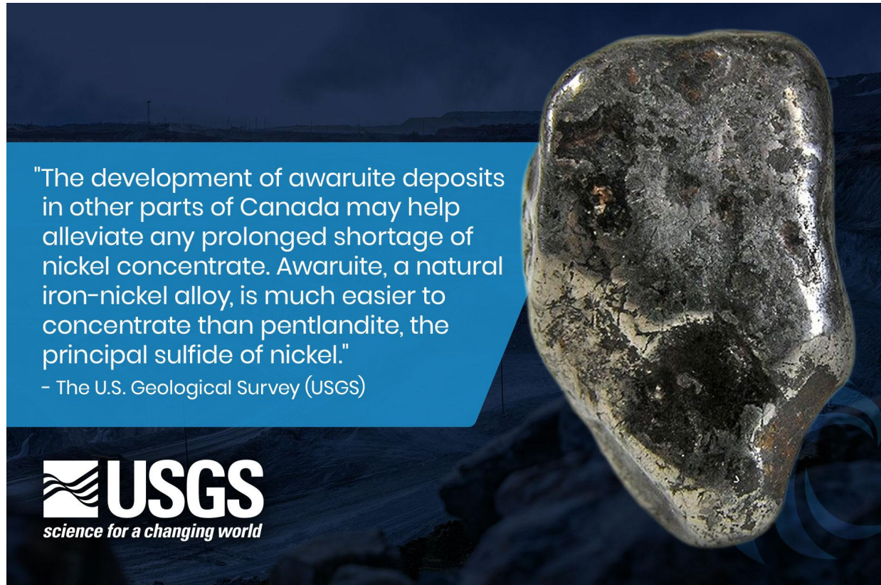
Figure 2: Quote from USGS on Awaruite Deposits in Canada

The development of awaruite resources is crucial, given China's control in the global nickel market. Chinese companies refine and smelt 68% to 80% of the world's nickel [4] and control an estimated 84% of Indonesia's nickel output, the largest worldwide supply [5] . Awaruite is a cleaner source of nickel that reduces dependence on foreign processing controlled by China, leading to a more secure and reliable supply for North America's stainless steel and electric vehicle industries.